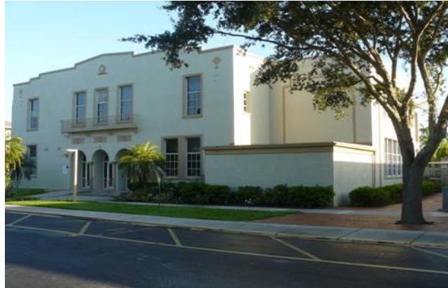
Alva Middle School, Alva, Florida